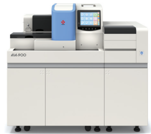
Pictured: AIA-900 with 9 Tray Sorter AIA-900 is also available with 19 Tray Sorter and as Loader Model (Benchtop or Floor)